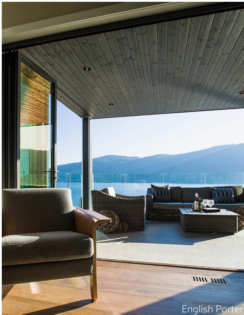
TEXAS HONEY BROWN